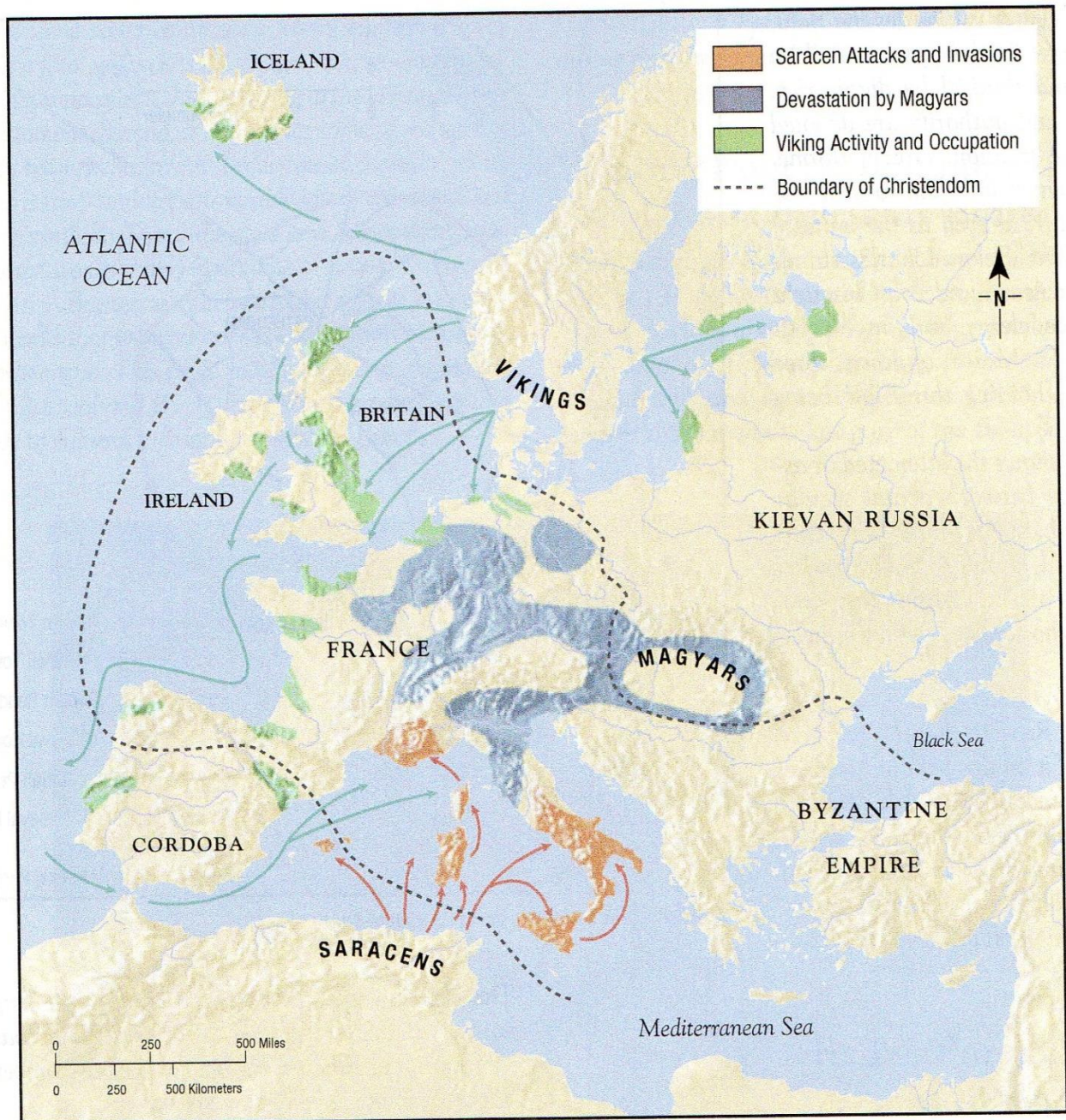
MAP 6.2 Non-Christian Pressures, Ninth and Tenth Centuries